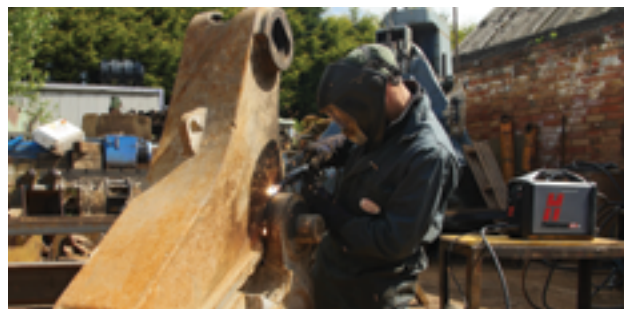
Maintenance and repair