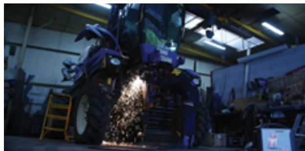
Agricultural and farm equipment maintenance